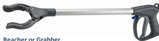
Reacher or Grabber. Image generated using Gemini.