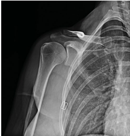
Normal Shoulder.

The surgery will relieve the pain and stiffness and help your arm move better. If you have a bad rotator cuff, you may have a reverse total shoulder replacement.