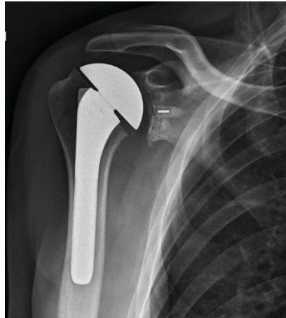
Total Shoulder Replacement.