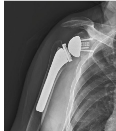
Reverse Shoulder Replacement