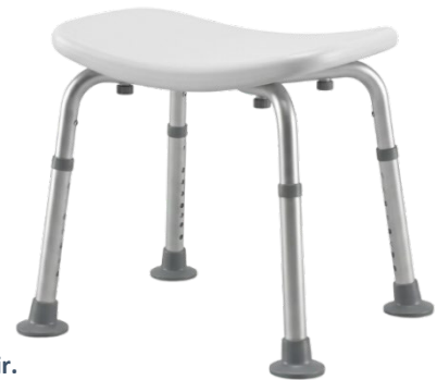
Shower Chair. Image generated using Gemini.